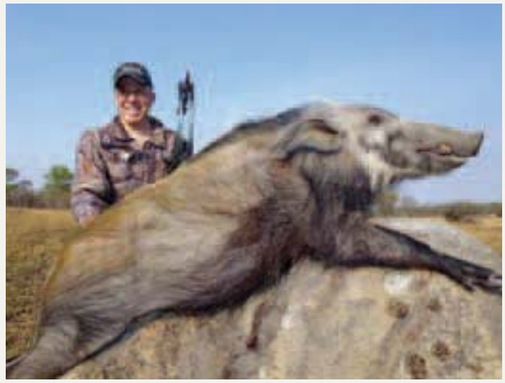
Bush pig - recovery • istance 120 meters.