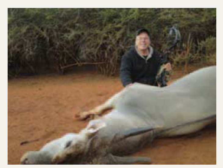
The Rage Hypo ermic 125 stoppe just uneer the hie on the off siee of this elane bull – near my right hane in the photo. Recovery • istance 30 meters.