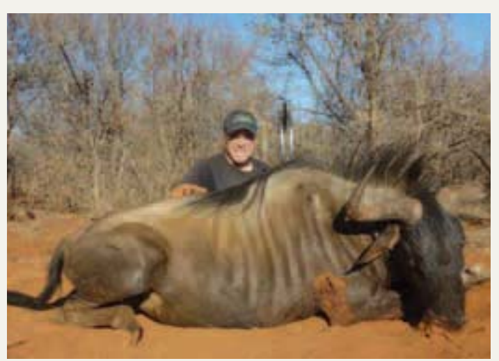
Blue Wileebeest - recovery eistance 85 meters.