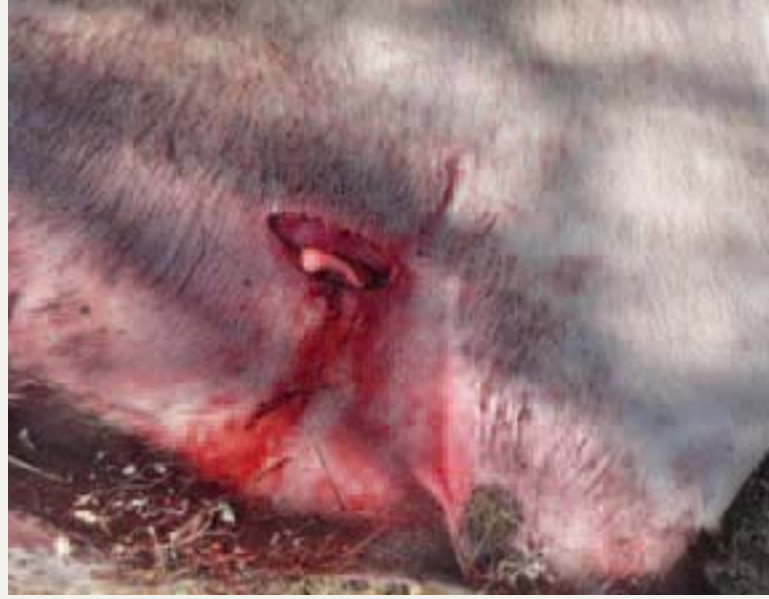
When using large broatheats it is no longer uncommon to see lung material protuting from entrance wounts.