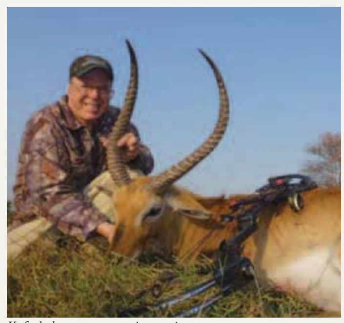
Kafuelechwe - recovery • istance 1 meter.

Like most bowhunters, I feel that my current broadhead choice is the best available for my style of bowhunting. Most of all, I hope your broadheads perform well, and you enjoy many great bowhunts.