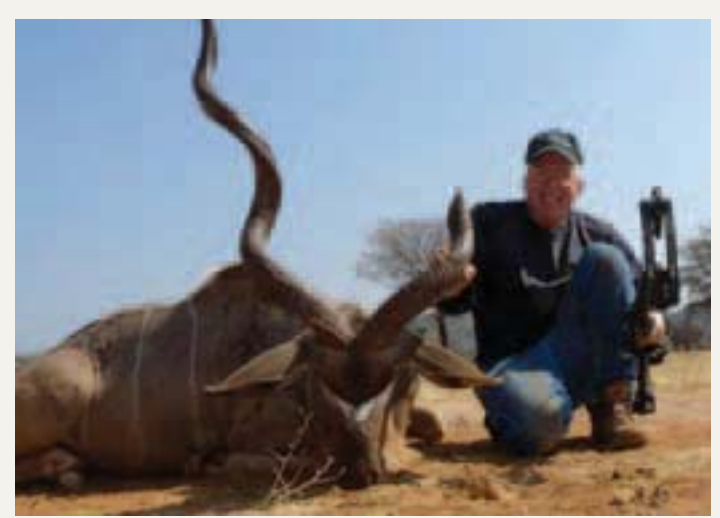
Ku•u - recovery •istance 40 meters.

The ferrules are made of steel, and feature a sleek,