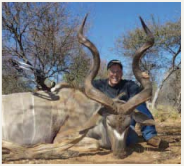
Ku•u - recovery •istance 90 meters.