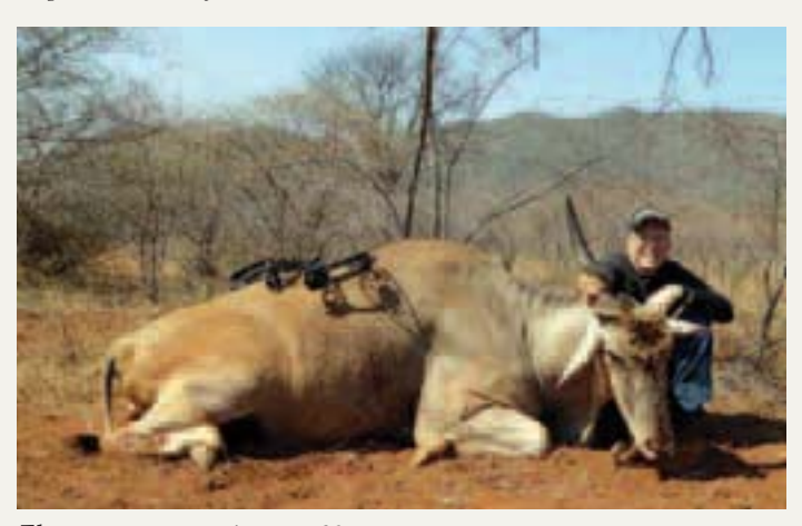
Elan• - recovery • istance 80 meters.