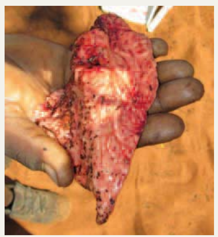
A large piece of lung material foun • 30 meters into a bloo • trail. The ku•u bull was recovere• at 90 meters.

ferrule, with a steel point screwed or pressed into the front. Two blade traditional heads may be stronger if machined from a single piece of steel and supported well to the tip. The steel must be of good quality and hardened correctly. All broadheads should be "razor" sharp, and be easy to sharpen and/or repair. I'll mention more about the repair issue below when I address my preferences.