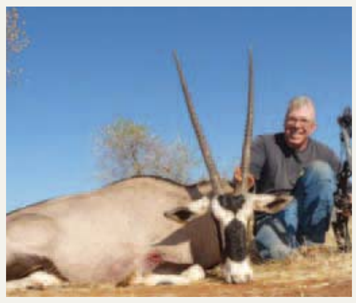
Gemsbok - recovery •istance 190 meters.