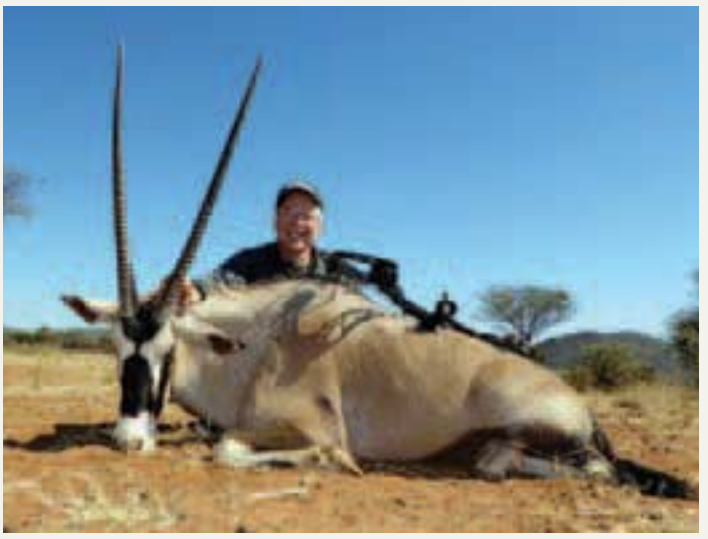
Gemsbok - recovery • istance 160 meters.