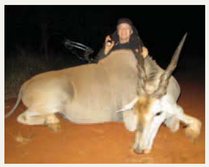
Elan - Recovery istance 105 meters

impala and such I most often get a pass through shot, unless the shot is taken from a quartering away angle.