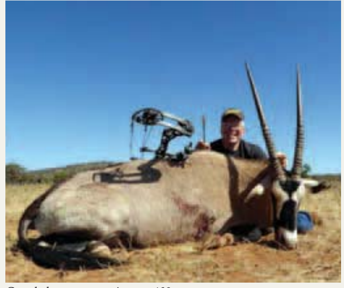
Gemsbok - recovery • istance 120 meters.