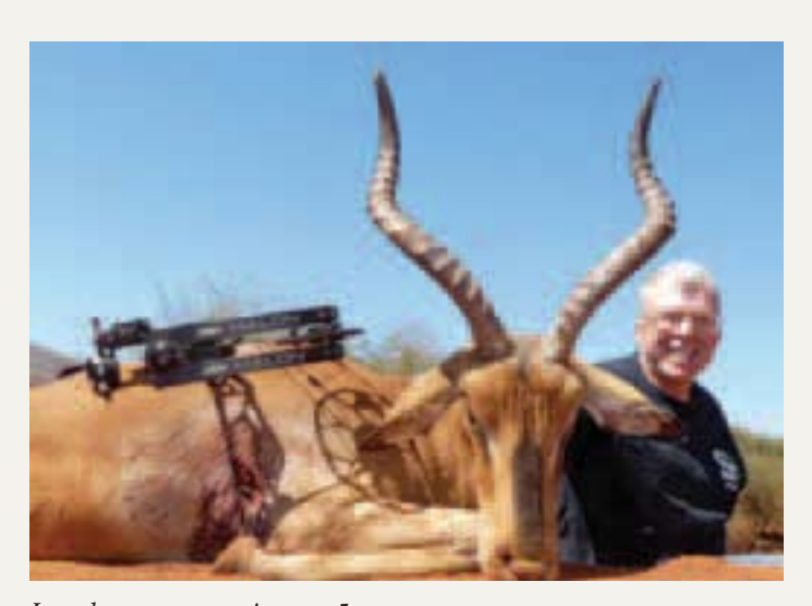
Impala - recovery • istance 5 meters.

I've also shot many animals with a variety of the Grim Reaper expandable broadheads. Most feature 3 or 4 blades with 1 1/2 to 1 3/4 inch cutting diameters. They are "over the top" deploying expandable heads, with an aluminum ferrule and steel point. They function well, but do suffer blade breakage and bent ferrules on occasion. They employ several internal parts, and are a bit tedious to repair. But