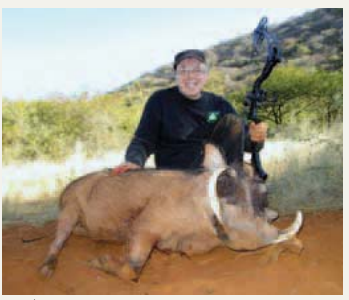
Warthog - recovery • istance 105 meters.